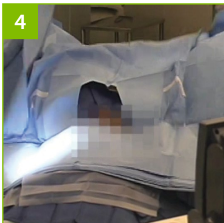
Step 4: With one person on either side of the patient, unfold toward the patient's feet, making sure you position the rounded portion over the patient's legs. Unfold the remainder of the drape toward anesthesia and secure to IV poles.