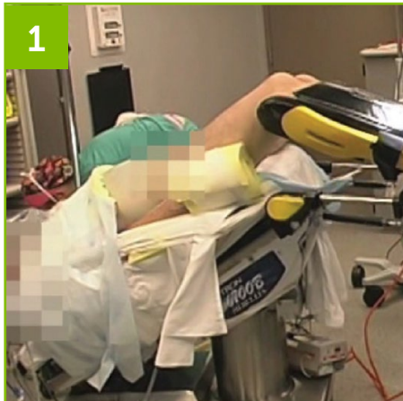
Step 1: Patient is in Trendelenburg position for ease of access of the robotic arm.

This drape includes features to meet the growing needs of robotic abdominal and pelvic surgery, including a trapezoidal fenestration, clear poly instrument pouches and convenient hook-n-loop tube holders.