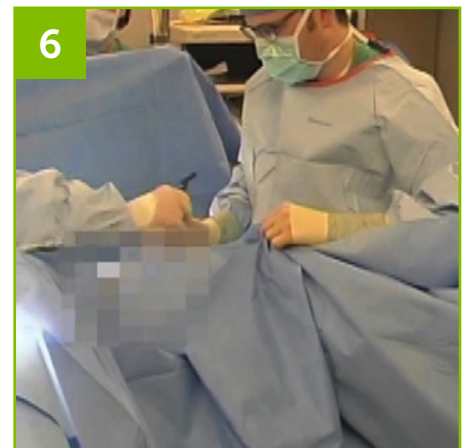
Step 6: Grasp the flaps and secure to the leggings with a towel clip to ensure proper coverage.