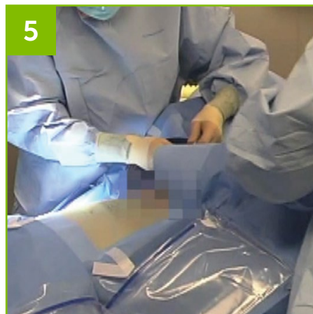
Step 5: Remove the release liner and secure the fenestration to patient's abdomen.